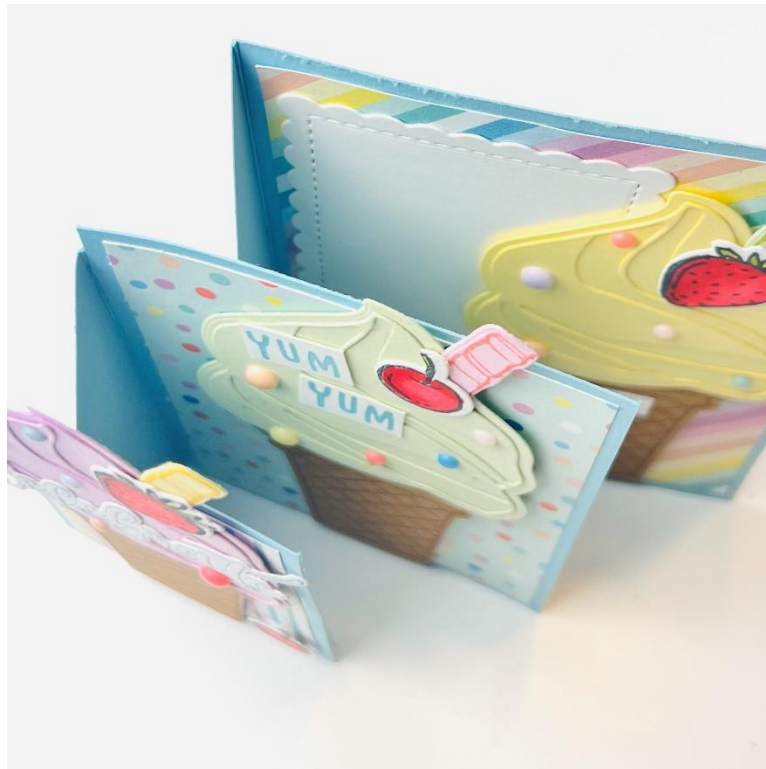
VIEW FROM TOP