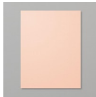
Petal Pink 8-1/2" X 11" Cardstock [146985] $8.75