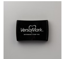
VersaMark Pad [102283] $9.50