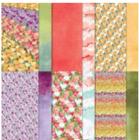
Flowering Fields 12" X 12" (30.5 X 30.5 Cm) Designer Series Paper [157670] $11.50