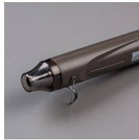
Heat Tool (Us And Canada)