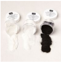
Basics Embossing Powders