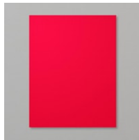
Poppy Parade 8-1/2" X 11" Cardstock [119793] $8.75