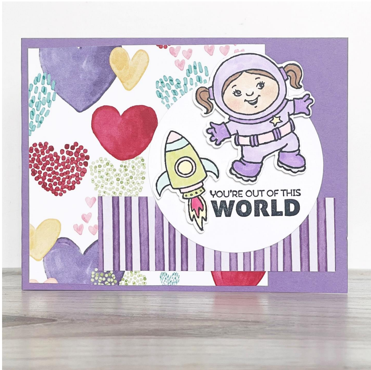
Alternate Card 3

Same basic concept for the focal point. However, I've turned the card into a landscape position and altered the placement of the layers to create an entirely different look.