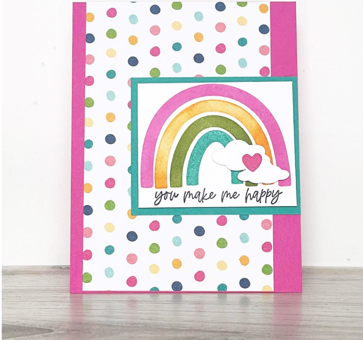
Alternate Card 3

I went bright & bold with a Magenta Madness card base. The polka dots in the Sunshine & Rainbows Designer Series Paper just adds to the fun. My focal point was stamped with the Rainbow of Happiness stamp set. I added a few die cut clouds and a heart for accent.