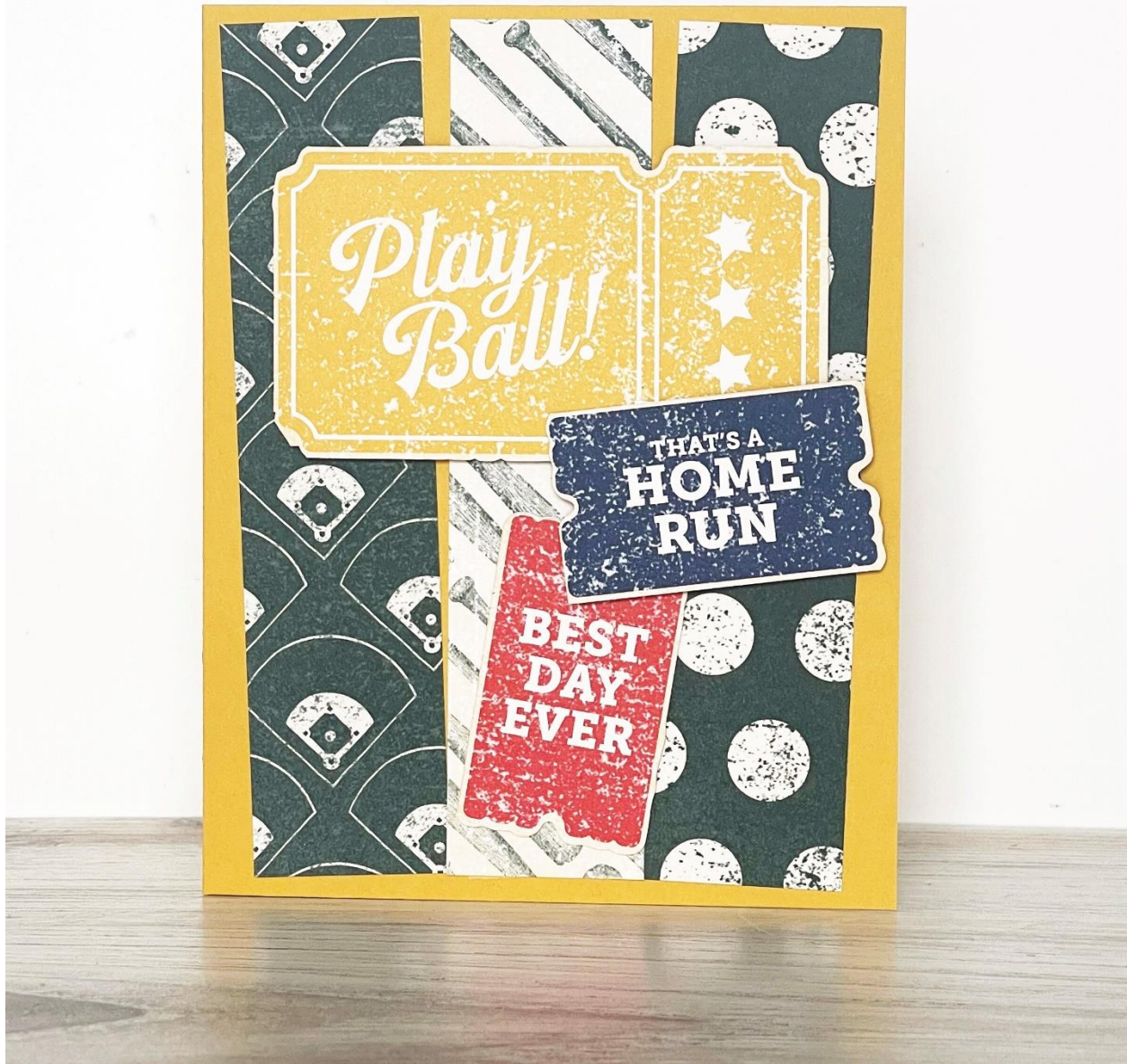
Alternate Card 3

This card features no stamping! The strips and focal point were cut from the Hey Sports Fan Designer Series Paper. I chose a wonky strip pattern again to give this card a whimsical feel.