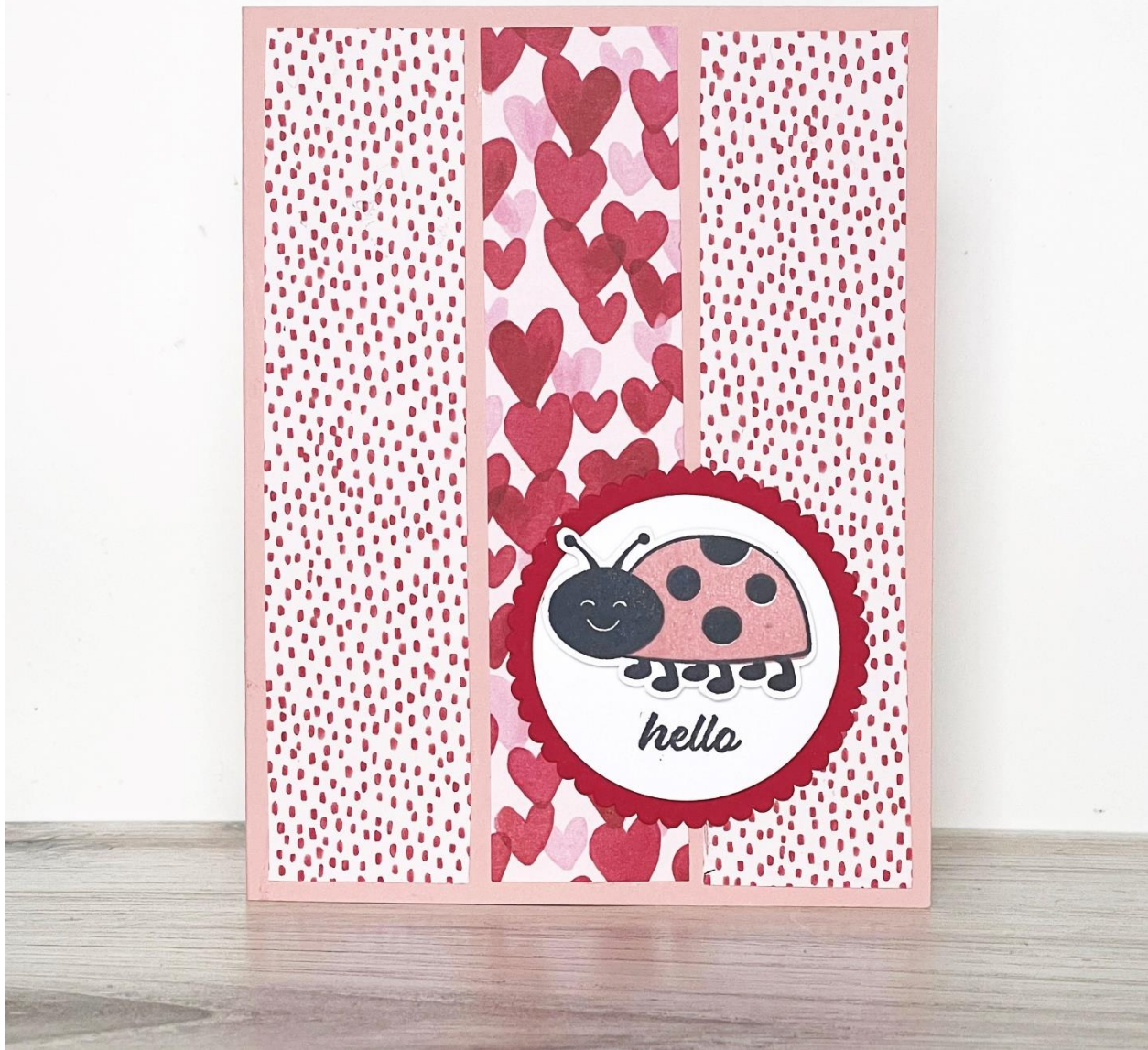
Alternate Card 1

On this card, I straightened the strips and evenly spaced them across the card base for a clean look. I also simplified the patterns by using 2 patterns instead of 3. The focal point is a simple ladybug image and greeting from the Hello Ladybug stamp set. Circles were cut with the Layering Circles Dies and the Stampin' Cut & Emboss Machine.