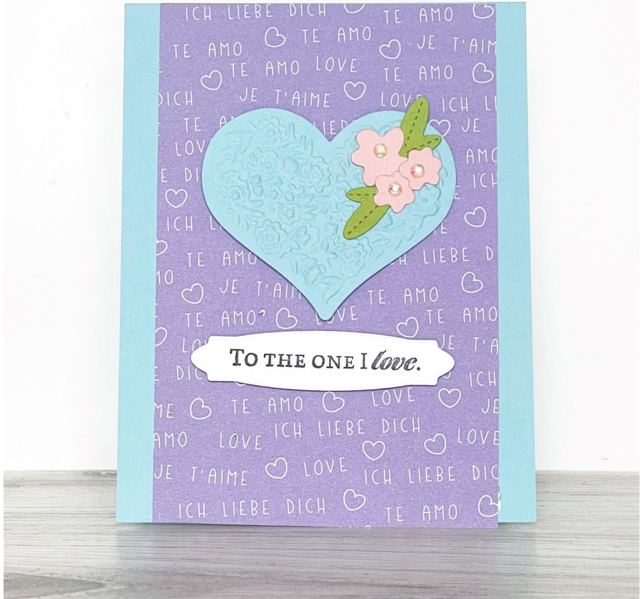
Alternate Card 2

This card uses the exact same base and layers as the last card. However, this time I used the other side of the paper and centered it on the card. Once again, the Love & Happiness bundle creates the focal point and is accented with the Iridescent Rhinestone Basic Jewels.