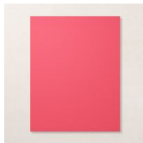
Sweet Sorbet 8 1/2" X 11" Cardstock [159268] $10.00