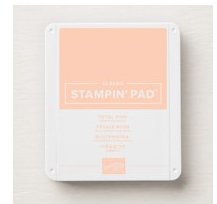
Petal Pink Classic Stampin' Pad [147108] $9.00