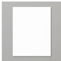
Basic White 8 1/2" X 11" Cardstock [159276] $10.50