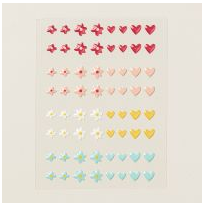
Adhesive Backed Hearts & Flowers [162557] $8.00