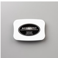
Tuxedo Black Memento Ink Pad [132708] $6.50