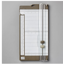
Paper Trimmer [152392] $26.00