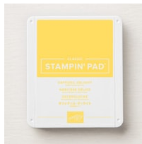
Daffodil Delight Classic Stampin' Pad [147094] $9.00