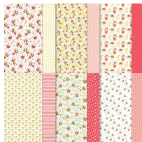
Bee Mine 12" X 12" (30.5 X 30.5 Cm) Designer Series Paper [162546] $12.50