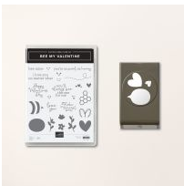
Bee My Valentine Bundle (English) [162554] $38.50