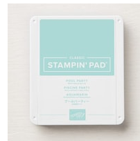
Pool Party Classic Stampin' Pad [147107] $9.00