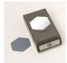
Heartfelt Hexagon Punch [162888] $22.00