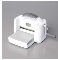
Stampin' Cut & Emboss