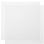
Window Sheets [142314] $5.00