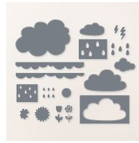
Bright Skies Dies