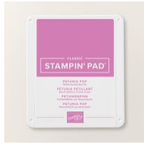
Petunia Pop Classic Stampin' Pad [163811] $9.00