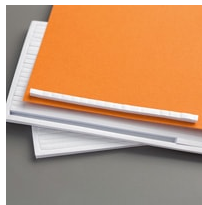
Foam Adhesive Strips [141825] $8.25