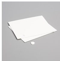
Stampin' Dimensionals [104430] $4.25