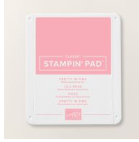
Pretty In Pink Classic Stampin' Pad [163807] $9.00