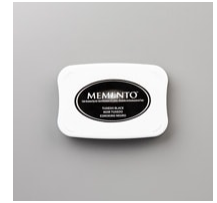
Tuxedo Black Memento Ink Pad [132708] $8.00