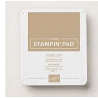
Crumb Cake Classic Stampin' Pad [147116] $9.00