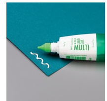
Multipurpose Liquid Glue [110755] $6.00