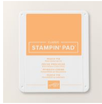
Peach Pie Classic Stampin' Pad [163810] $9.00