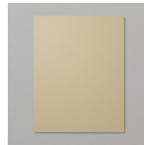
Crumb Cake 8-1/2" X 11" Cardstock [120953] $11.50