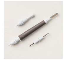
Take Your Pick