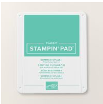
Summer Splash Classic Stampin' Pad [163809] $9.00