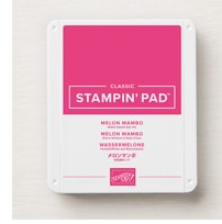
Melon Mambo Classic Stampin' Pad [147051] $9.00