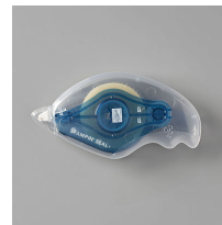
Stampin' Seal+ [149699] $12.00