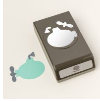
Submarine Life Builder Punch [162534] $24.00