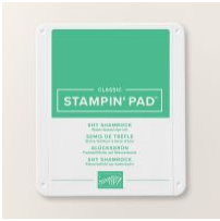
Shy Shamrock Classic Stampin' Pad [163808] $9.00