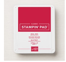
Real Red Classic Stampin' Pad [147084] $9.00