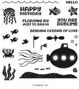
Submarine Life Photopolymer Stamp Set (English) [162542] $24.00