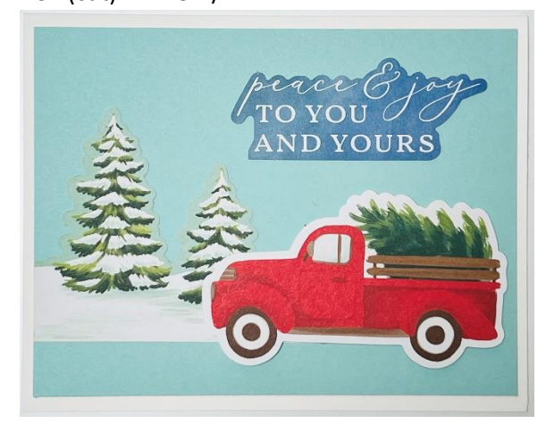
Card Base: Basic White Layer: Pool Party