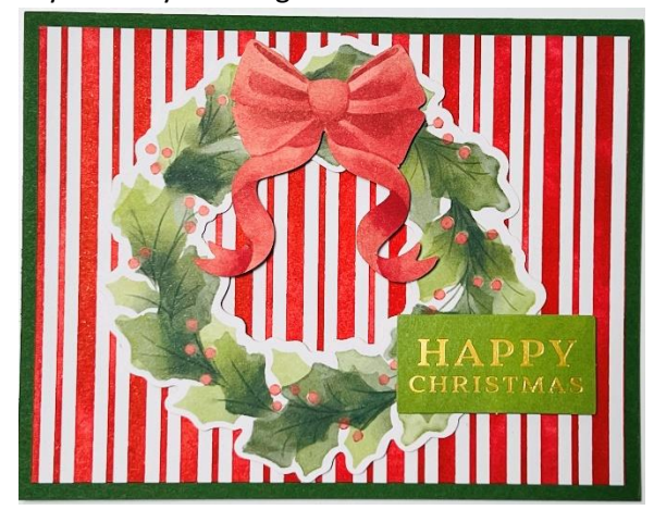
Card Base: Garden Green DSP (cut): 4" x 5-1/4"