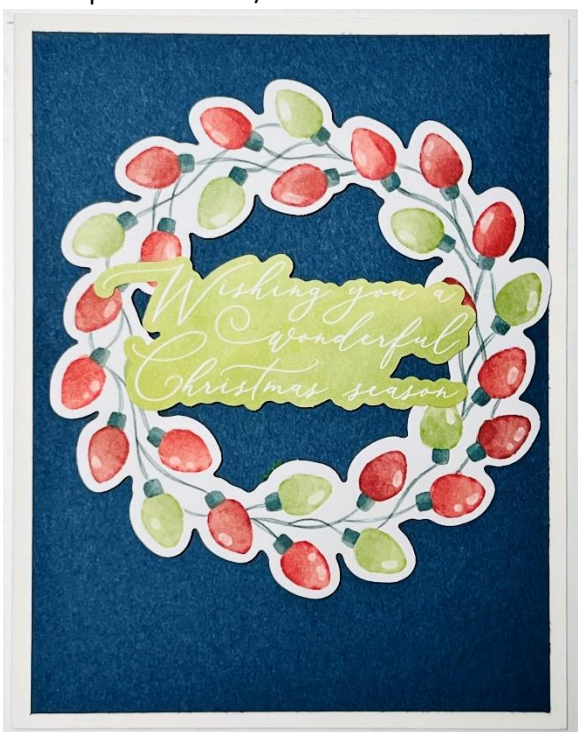
Card Base: Basic White Layer: Misty Moonlight