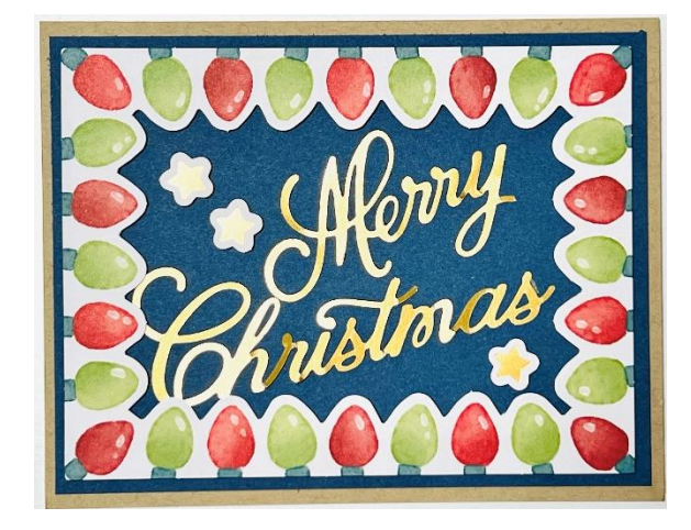
Card Base: Crumb Cake Layer: Misty Moonlight