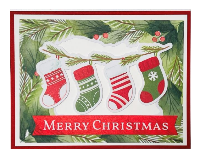
Card Base: Real Red Layer: Basic White