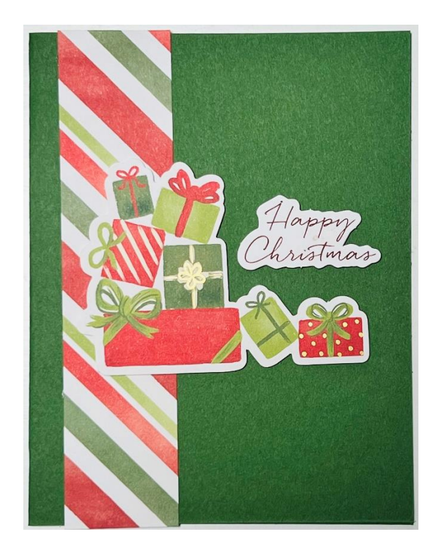
Card Base: Garden Green Cut strip down to 5-1/2"