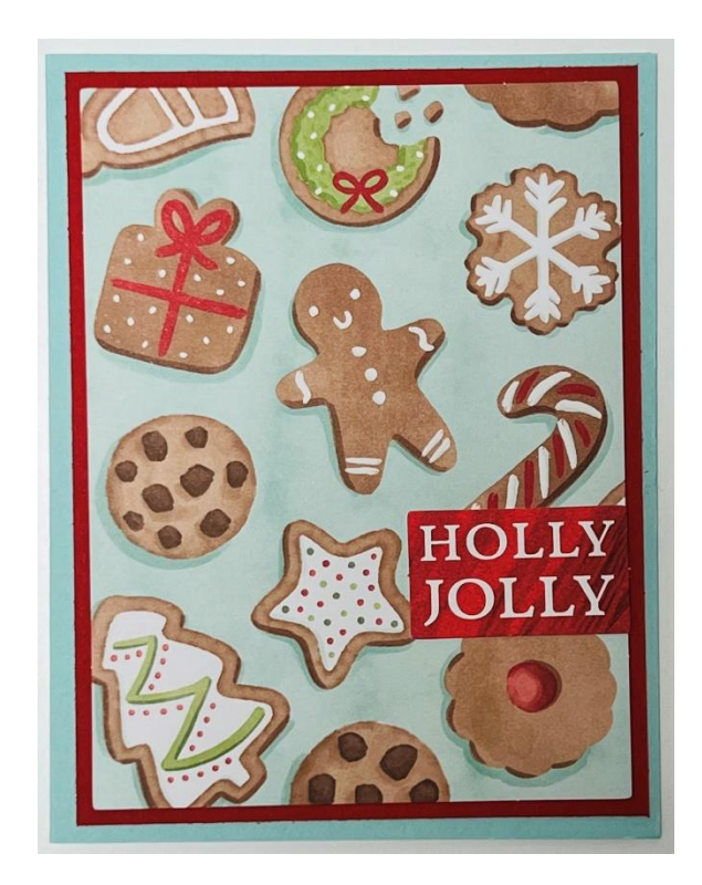
Card Base: Pool Party Layer Real Red