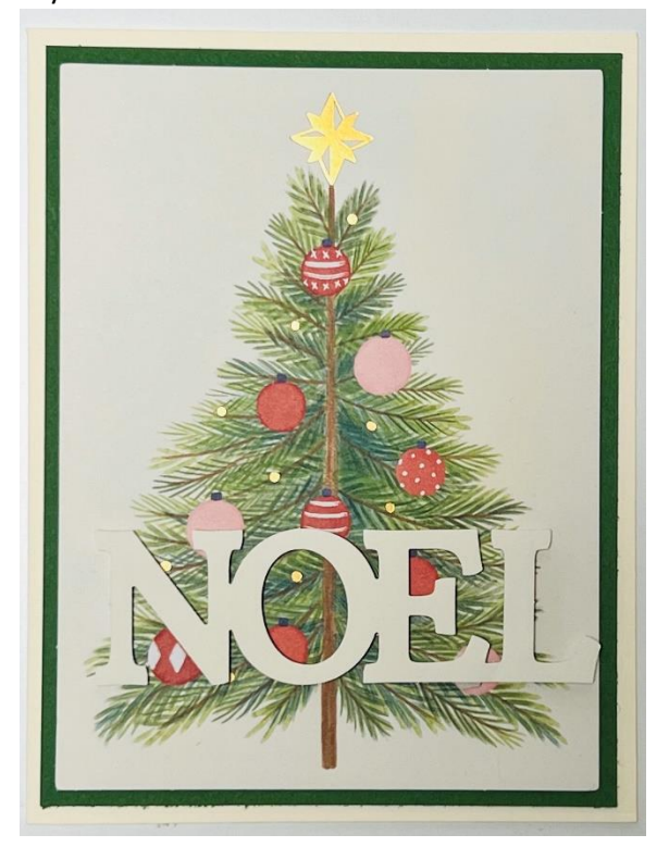
Card Base: Very Vanilla Layer: Garden Green