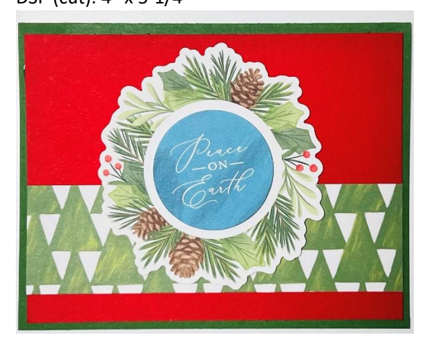
Card Base: Garden Green Layer: Real Red