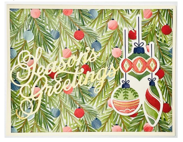
Card Base: Very Vanilla DSP (cut): 4" x 5-1/4"