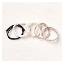
Baker's Twine Essentials