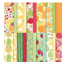
Fruit Salad 6" X 6" (15.2 X 15.2 Cm) Designer Series Paper