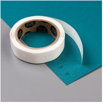
Mini Glue Dots