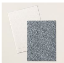
Starstruck Embossing Folder