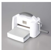
Stampin' Cut & Emboss