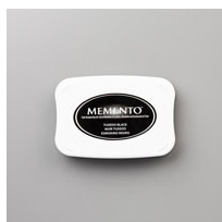
Tuxedo Black Memento Ink