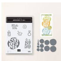
Around It All Bundle