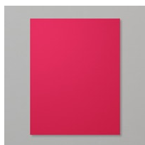
Real Red 8-1/2" X 11"