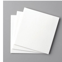
Foam Adhesive Sheets [152815] $8.25