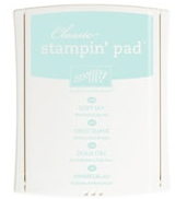
Soft Sky Classic Stampin' Pad [131181] $6.50