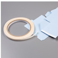
Tear & Tape Adhesive [138995] $7.00