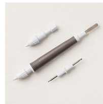
Take Your Pick [144107] $12.00