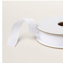
White 1/2" (1.3 Cm) Woven Ribbon [164634] $9.50