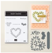
Heart Shaped Bundle (English) [164953] $31.50