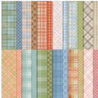
Timeless Plaid 6" X 6" (15.2 X 15.2 Cm) Designer Series Paper [164678] $12.50