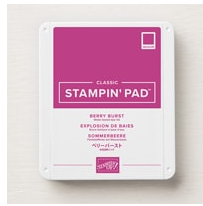
Berry Burst Classic Stampin' Pad [147143] $9.00