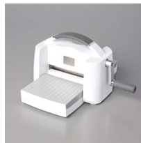
Stampin' Cut & Emboss Machine [149653] $130.00