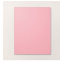
Pretty In Pink 8 1/2" X 11" Cardstock [163793] $11.50