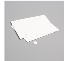
Stampin' Dimensionals [104430] $4.25