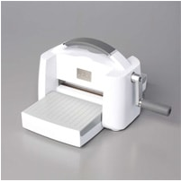
Stampin' Cut & Emboss