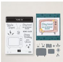
Tune In Bundle (English)