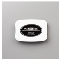
Tuxedo Black Memento Ink