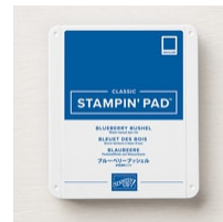
Blueberry Bushel Classic