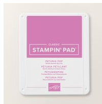
Petunia Pop Classic Stampin'