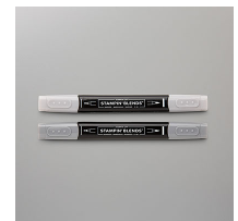
Smoky Slate Stampin' Blends