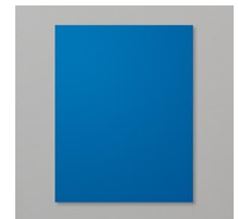
Blueberry Bushel 8-1/2" X 11"