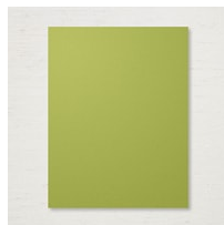
Old Olive 8-1/2" X 11"