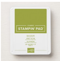
Old Olive Classic Stampin'